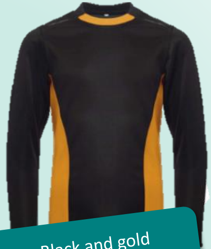
Black and gold multisport top