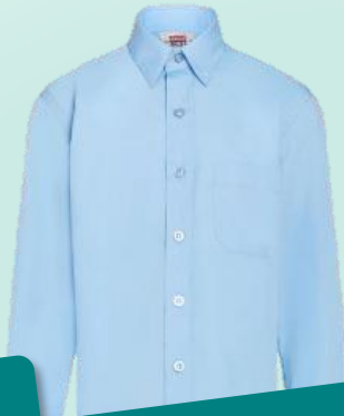
Blue shirt or blouse