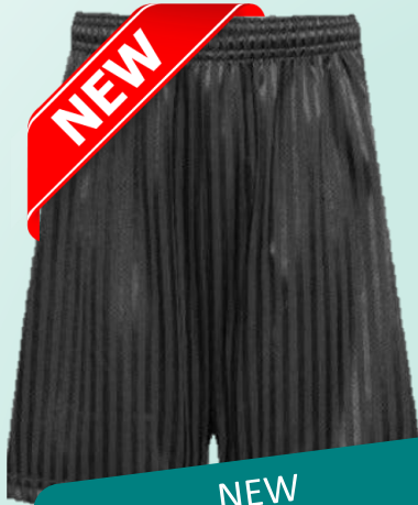
NEW Loose fitting, black PE shorts (not lycra.)

There are no major changes to our uniform policy from previous years, but as we strive for excellence and equity, we will enforce our policy with 'no excuses' to ensure that we hold every student to the same high standard. Tutors will check uniform at line up each morning. Please support us in setting the tone by ensuring your child comes to school in the correct attire.