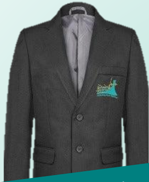
Saltash School blazer

There are no major changes to our uniform policy from previous years, but as we strive for excellence and equity, we will enforce our policy with 'no excuses' to ensure that we hold every student to the same high standard. Tutors will check uniform at line up each morning. Please support us in setting the tone by ensuring your child comes to school in the correct attire.