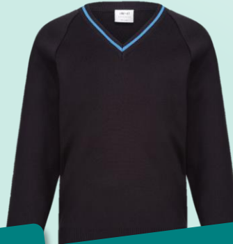
Black V-necked jumper with sky blue stripe