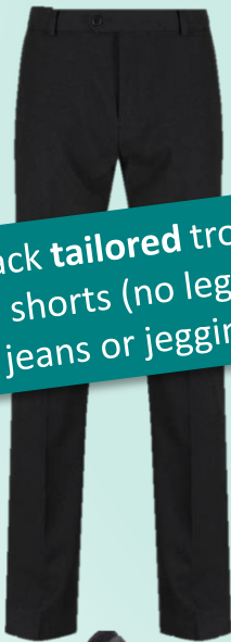
Black tailored trousers or shorts (no leggings, jeans or jeggings.)