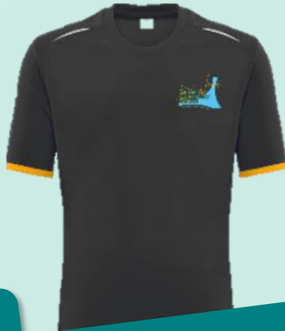
Black and gold T-shirt with school motif