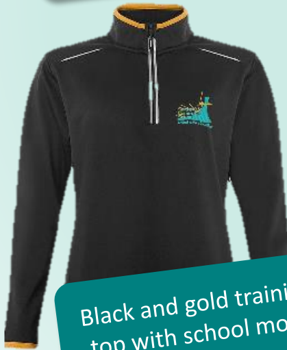
Black and gold training top with school motif