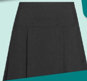
Black drop waist pleated skirt