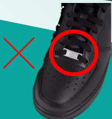
Black, flat- heeled, polishable school shoes- NO TAGS!