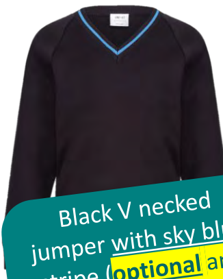
Black V-necked jumper with sky blue stripe ( optional and always to be worn alongside, and not instead of, a blazer)