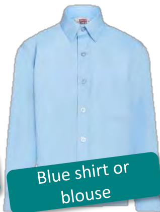
Blue shirt or blouse