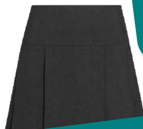
Black drop waist pleated skirt