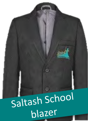
Saltash School blazer