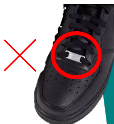
Black, flat- heeled, fully polishable (no canvas or material elements) school shoes with NO TAGS *NEW: Plain black socks (no logos)*

*School ties for incoming year 7, and for anyone requiring a new tie going forward, must include your house colour and can only be purchased from the school through Parent Pay.