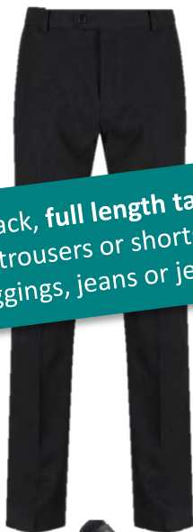
Black, full length tailored trousers or shorts (no leggings, jeans or jeggings.)